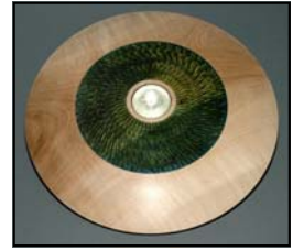
Gold Leaf insert

For the September meeting we will be raffling the walnut lidded box. You can purchase your raffle tickets at the meeting. If you cannot attend the meeting you can send your money to Ken Emerson ahead of time. You do not need to be present to win.