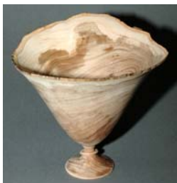
End grain vase

The following items will be raffled at the upcoming meetings.