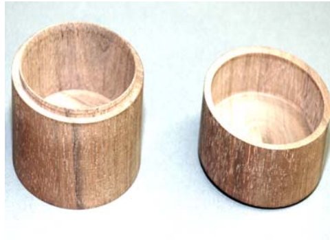
Walnut box to be raffled at the September meeting