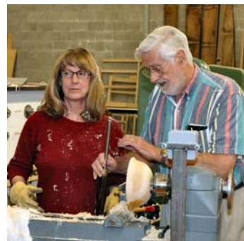
Sage in action