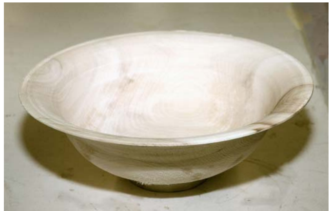
Let the bowl sit for an hour then do the final sanding