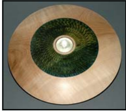
Gold Leaf insert

The raffle of the Jimmy Clewes items continues. The tickets are $1 each or 6 for $5. For the next meeting we will be raffling off the Natural Edge Bowl. These other items will be coming up in future meetings. If you cannot get to the meeting for the raffle, contact Ken Emerson to purchase your tickets in advance.