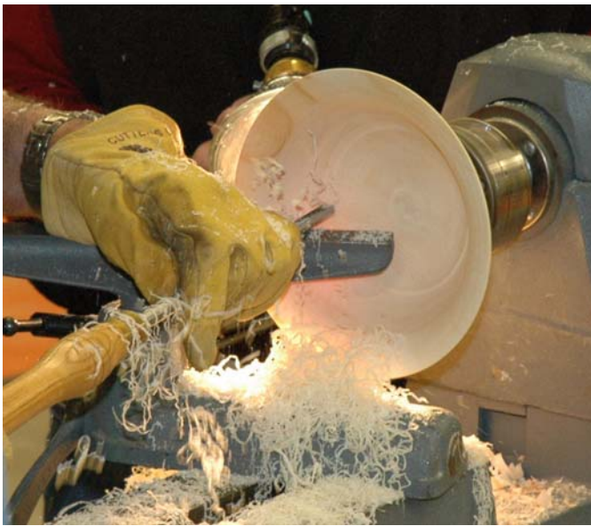
A backlight helps with gauging the thickness