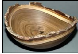
Natural edge bowl to be raffled at the November meeting