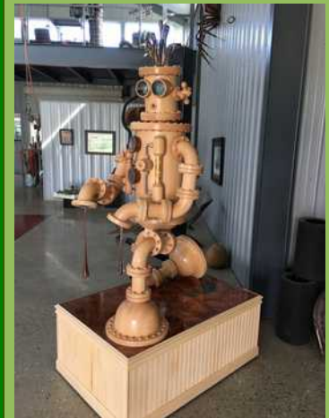
Found on the AAW Forum Gallery--WOW!